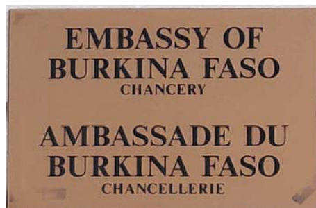
The plaque on the front of the Burkina Faso embassy, in English and French.

This parallels a Montreal flag I own, with a similar header-on-fly manufacturing error.