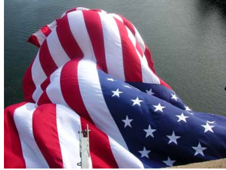
The U.S. flag displayed on the bridge at Oregon City, 9/11/2004.

As we approach the 25th anniversary of 9/11 this year, what flag-related commemorations might we see?