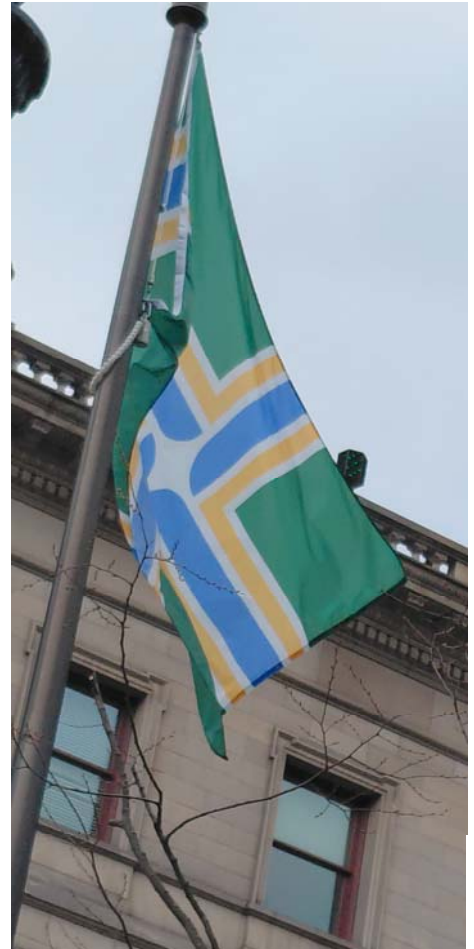
A mis-manufactured Portland flag flies at Portland’s city hall in March 2026. The header is sewn on the fly end!