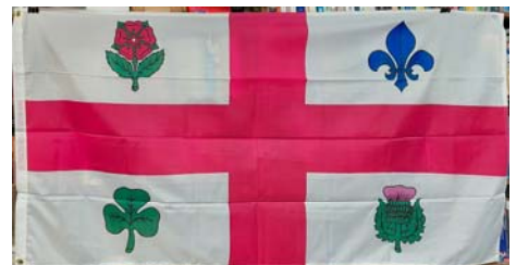
A mis-manufactured Montreal flag, with the header sewn to the fly. (This is the former design, so it really does need retiring. The current design has a pine tree added to honor indigenous Montrealers.)