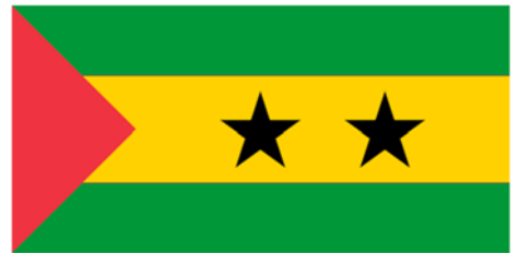
São Tomé and Príncipe.