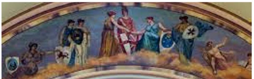
Australian State Shields Mural, Royal Exhibition Building, Melbourne.