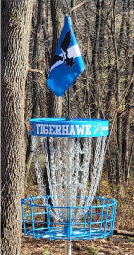
The flag of Colfax, Iowa, now tops the targets in the Tigerhawk Disc Golf Course.