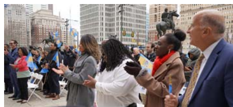
Spectators applaud the event.