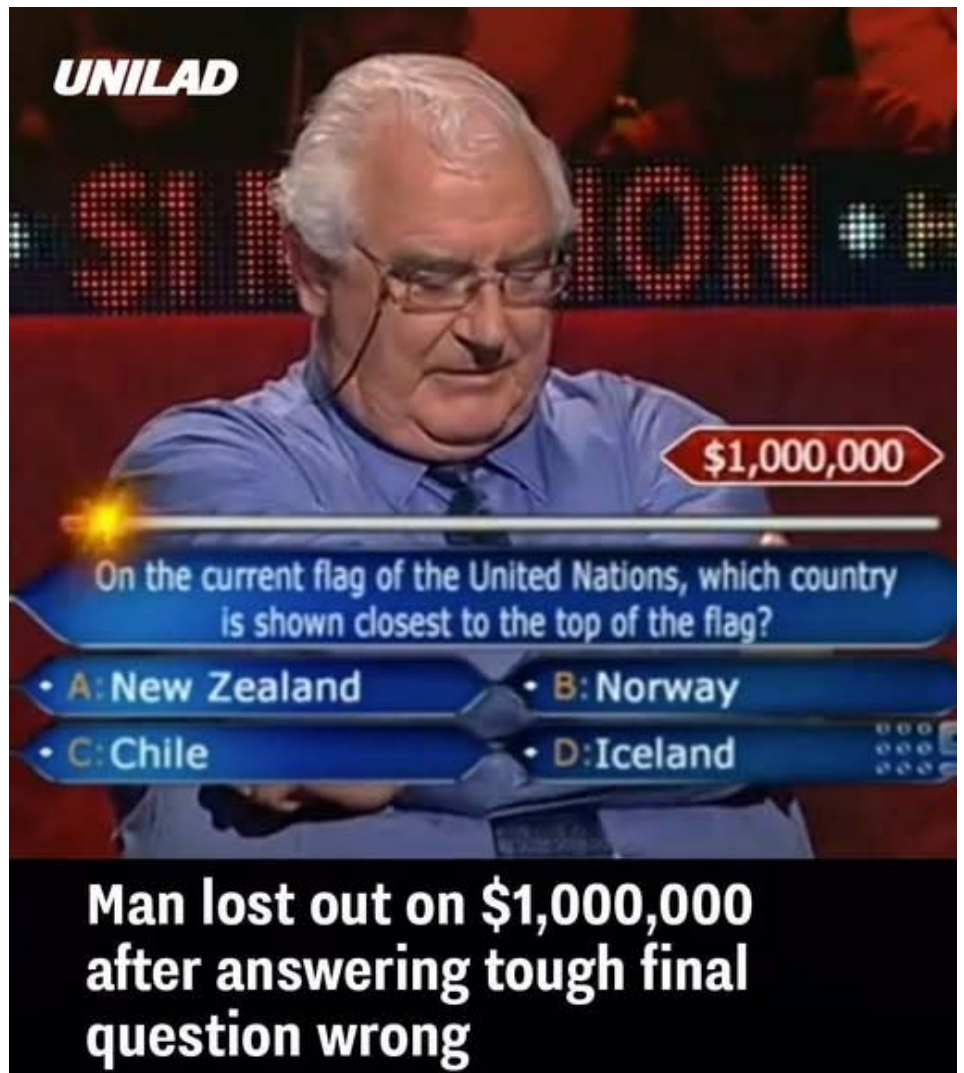
Man lost out on $1,000,000 after answering tough final question wrong