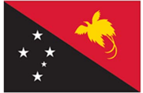
Papua New Guinea.