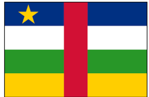
Central African Republic.