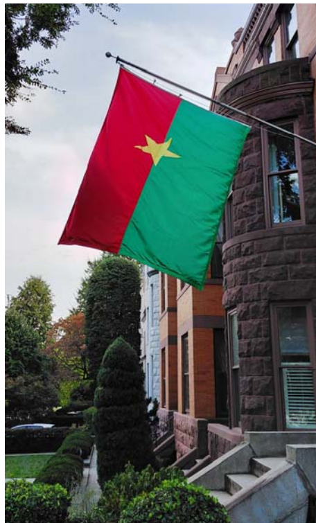
A mis-manufactured Burkina Faso flag flies at the country’s embassy in Washington, D.C., in March 2026.

The manufacturer had mistakenly sewn the header to the fly end of the flag and not to the hoist. And of course, our city fathers had not noticed.