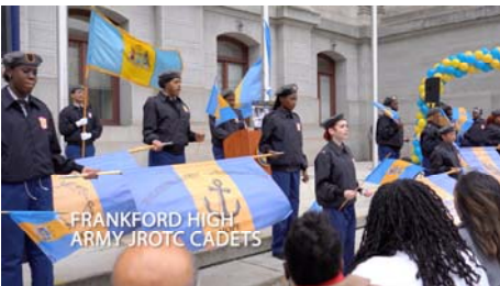
Frankford High JROTC cadets, Northeast Philly, recite their Philly Flag Jody chant.