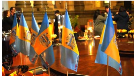
Philly flags adorn the Caucus Room luncheon.