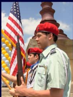
FRANKFORD ARMY JROTC CADETS