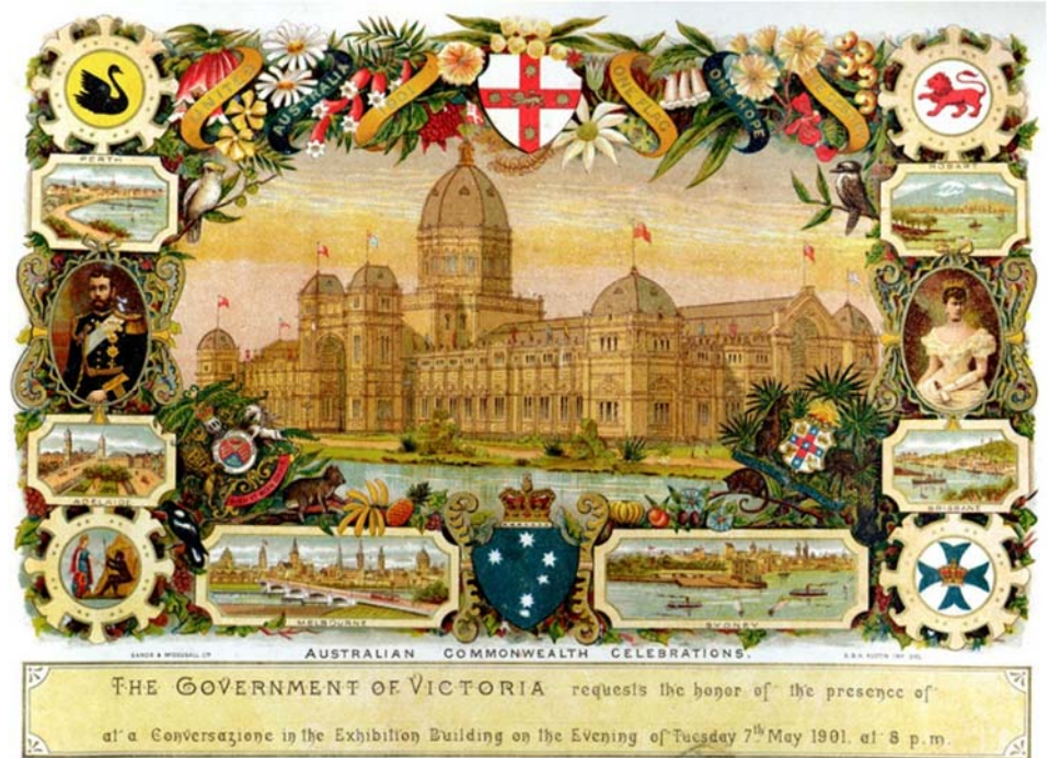
An invitation (replete with state symbols) issued by the government of Victoria to a “Conversazione”, as part of the Australian Commonwealth celebrations.

Later in the year, a version of the national flag would be adopted, with its “commonwealth star” and Crux Australis symbolism. Meanwhile, British and state emblems prevailed.