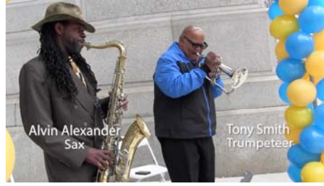
Philly jazz musicians play as attendees gather.