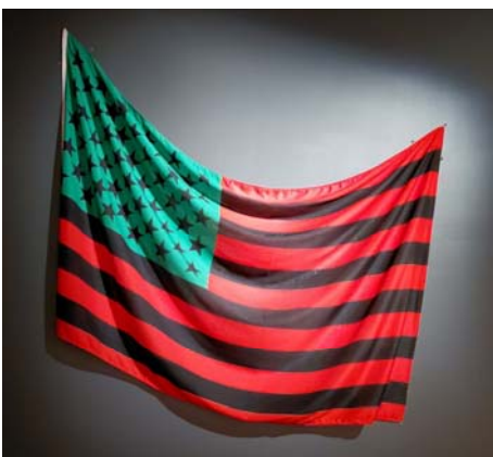
African-American Flag (1990), by David Hammons, exhibited in the National Museum of African American History and Culture. It uses the Marcus Garvey colors of red-green-black (used widely in Africa).