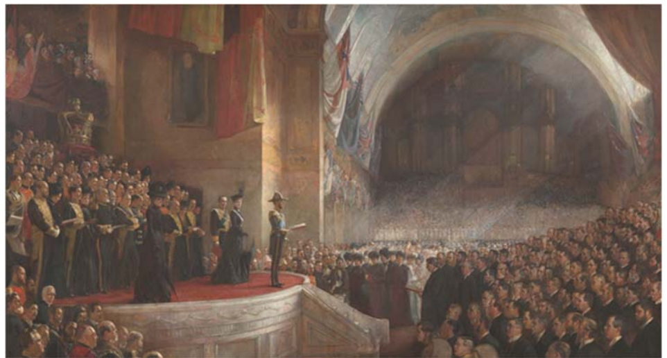
The Opening of the First Parliament of the Commonwealth of Australia by HRH the Duke of Cornwall and York [later King George VI], May 9, 1901.